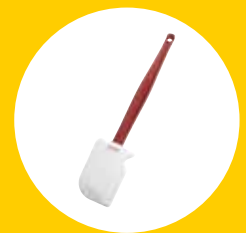
HIGH HEAT SPATULA FG1963000000