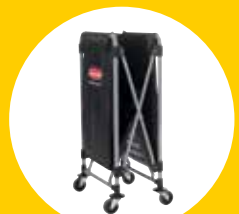
COLLAPSIBLE X-CART, 8 BUSHELS 1881750