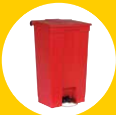
STEP-ON CONTAINER FG614600RED