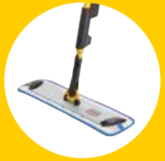
HYGEN™ PULSE™ MICROFIBER MOP KIT 1835528