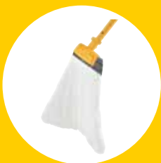
SPILL MOP PAD AND HANDLE 2017059 & 2017161