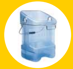
ICE TOTE WITH BIN HOOK ADAPTER FG9F5400BLUE