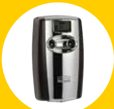
MICROBURST® DUET DISPENSER FG4870055