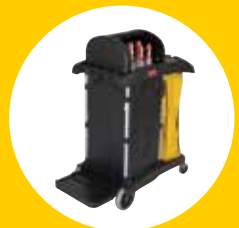
JANITORIAL CLEANING CART – HIGH-SECURITY WITH DOORS AND HOOD FG9T7500BLA