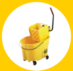
35 QT WAVEBRAKE® SIDE-PRESS BUCKET AND WRINGER FG758088YEL