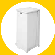
DEFENDERS® SQUARE STEP-ON FGST24EPLWH