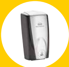
AUTOFOAM TOUCH-FREE DISPENSER FG750411