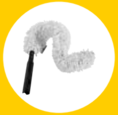
HYGEN™ FLEXIBLE DUSTING WAND AND MICROFIBER SLEEVE FGQ85200WH00