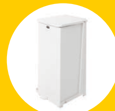
DEFENDERS® SQUARE STEP-ON FGST24EPLWH