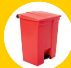
STEP-ON CONTAINER FG614500RED