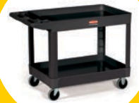
2-SHELF UTILITY CART WITH ERGO HANDLE AND LIPPED SHELF, MEDIUM FG452088BLA