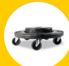
BRUTE® QUIET DOLLY FG264043BLA