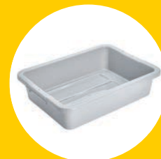
UTILITY BUS BOX FG334900GRAY