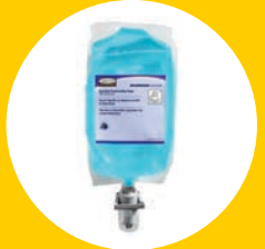
AUTOFOAM REFILL - ENRICHED HAND SOAP WITH MOISTURIZERS FG750112