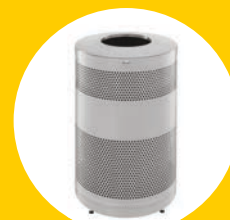
CLASSICS OPEN TOP FGS55STSPL