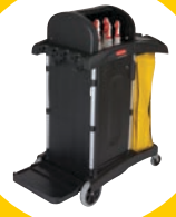
JANITORIAL CLEANING CART - HIGH-SECURITY WITH DOORS AND HOOD FG9T7500BLA