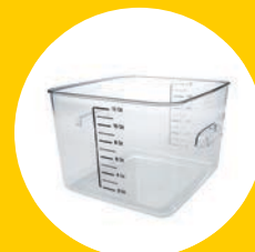
SQUARE STORAGE CONTAINER FG631200CLR