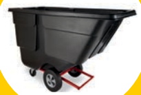
ROTOMOLDED TILT TRUCK FG131400BLA