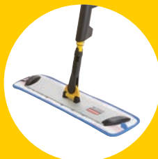
HYGEN™ PULSE™ MICROFIBER MOP KIT 1835528