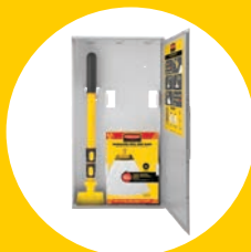
BIOHAZARD SPILL MOP KIT 2031094