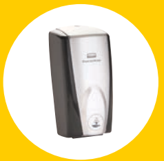
AUTOFOAM TOUCH-FREE DISPENSER FG750411