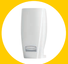
TCELL™ DISPENSER 1793547