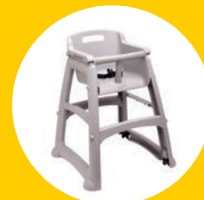
STURDY CHAIR™ YOUTH SEAT WITH WHEELS FG780508PLAT