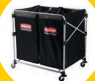
COLLAPSIBLE MULTI-STREAM X-CART 1881781