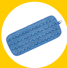
HYGEN™ MICROFIBER WALL/STAIR DAMP MOP FGQ82000BL00