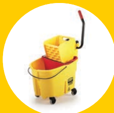
WAVEBRAKE® SIDE-PRESS BUCKET AND WRINGER FG758088YEL