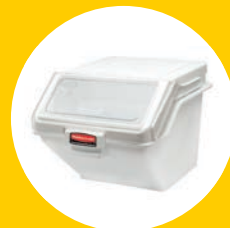
PROSAVE® SHELF INGREDIENT BIN WITH 2C SCOOP FG9G5800WHT