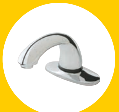
AUTOFAUCET® CENTER SET MILANO 1818967