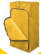
JANITORIAL CLEANING CART VINYL BAG – TRADITIONAL 1966719