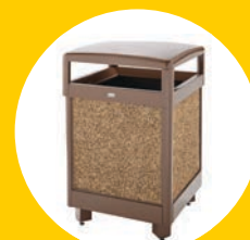
ASPEN HINGED TOP FGR38HT201PL