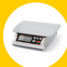
DISHWASHER-SAFE DIGITAL PORTIONING SCALE 1812595