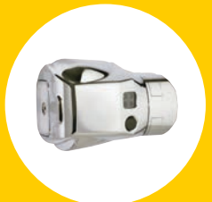
AUTOFLUSH® TOILET FLUSHER FG401805A