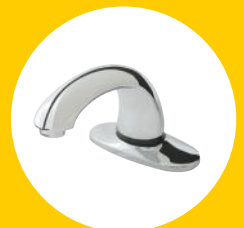
AUTOFAUCET® CENTER SET MILANO 1782743