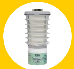
TCELL™ REFILL – CUCUMBER MELON FG402470