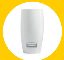
TCELL™ DISPENSER 1793547