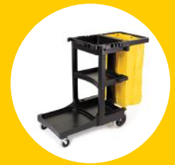
JANITORIAL CLEANING CART – TRADITIONAL FG617388BLA