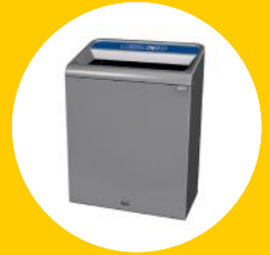
CONFIGURE™ 1-STREAM MIXED RECYCLING CONTAINER 1961508