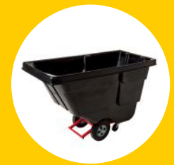
UTILITY TILT TRUCK – ROTOMOLDED FG130400BLA