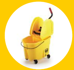
35 QT WAVEBRAKE® DOWN-PRESS BUCKET AND WRINGER FG757788YEL