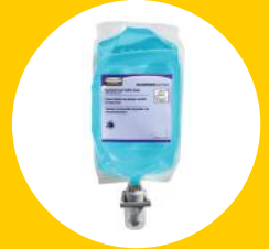
AUTOFOAM REFILL - ENRICHED HAND SOAP WITH MOISTURIZERS FG750112