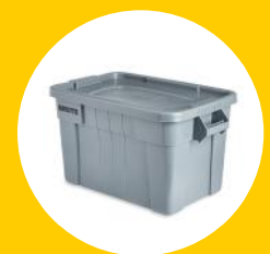
BRUTE® TOTE STORAGE BIN WITH LID FG9S3100GRAY