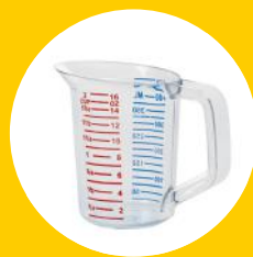
BOUNCER® MEASURING CUP FG321500CLR