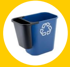
RECYCLING WASTEBASKET WITH SIDE BIN FG295673BLUE AND FG295073BLA