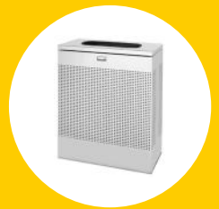
SILHOUETTES LARGE RECTANGLE CONTAINER FGSR18SSPL