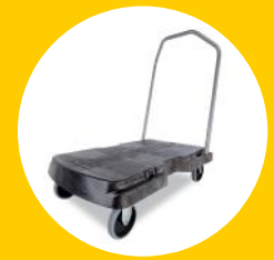
TRIPLE TROLLEY WITH ERGONOMIC HANDLES FG440100BLA