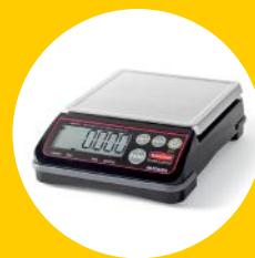
HIGH PERFORMANCE DIGITAL PORTIONING SCALE 1812590