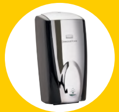
AUTOFOAM TOUCH-FREE DISPENSER FG750411