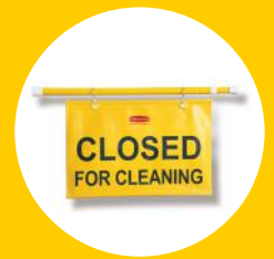
EXTENDABLE "CLOSED FOR CLEANING" HANGING SIGN FG9S1500YEL