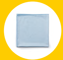
HYGEN™ GLASS/MIRROR MICROFIBER CLOTH FGQ63000BL00