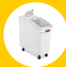
PROSAVE® INGREDIENT BIN WITH 32 OZ SCOOP FG360088WHT