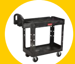
2-SHELF HD UTILITY CART WITH ERGO HANDLE AND LIPPED SHELF, MEDIUM FG452088BLA