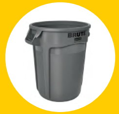
BRUTE® CONTAINER WITH VENTING CHANNELS FG263200GRAY