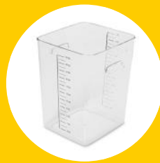
SQUARE STORAGE CONTAINER FG632200CLR