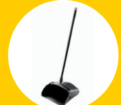
EXECUTIVE SERIES™ LOBBY PRO® DUST PAN FG253100BLA