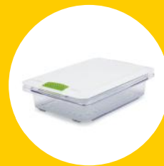
FRESHWORKS™ PRODUCE SAVER CONTAINER AND LID 2052983 AND 2052934