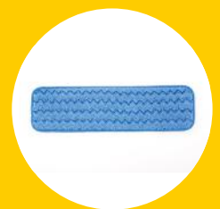
HYGEN™ MICROFIBER WET PAD FGQ41000BL00